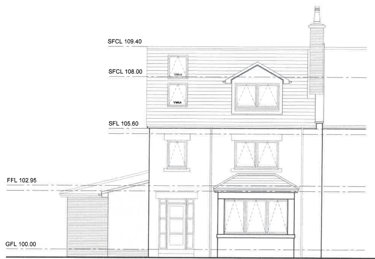
Front Elevation Proposed