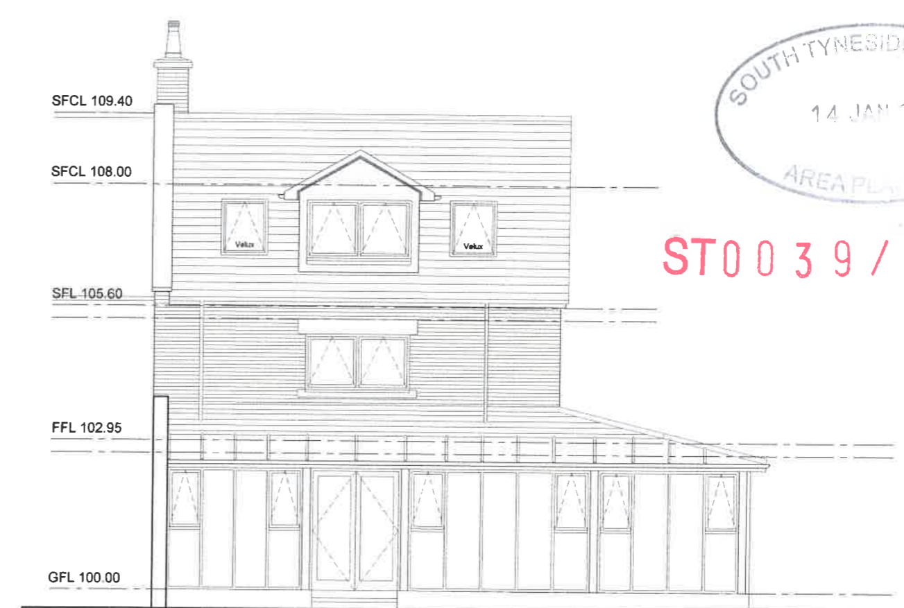
Rear Elevation Proposed